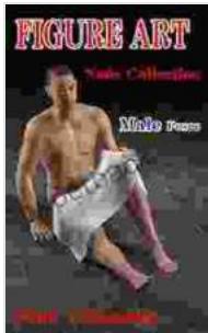
FIGURE ART Nude Collection Male Poses by Linda Simon

Figure Art Nude Collection: Male Poses is the ultimate guide to drawing the male figure. This comprehensive book features over 300 reference photos of male models in a variety of poses, from classical to contemporary. With detailed instructions and expert advice, this book will help you master the art of drawing the male figure.