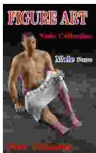
FIGURE ART Nude Collection Male Poses by Linda Simon